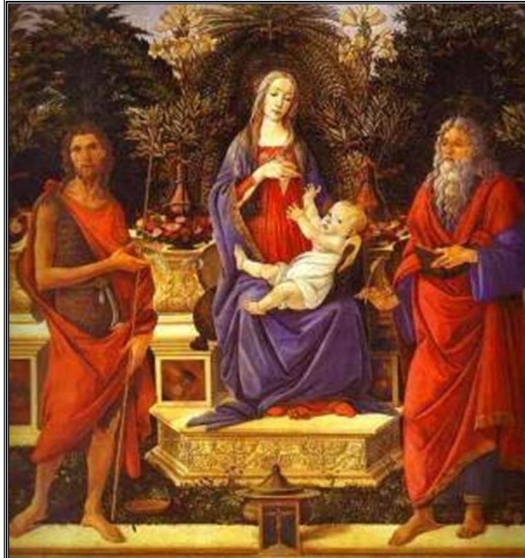
Botticelli, 1484. Virgin and Child Enthroned between Saint John the Baptist and Saint John the Evangelist. Tempera on panel. Gemaldegalerie, Berlin

The night of December 27 th is set aside in our Masonic calendar to honor St. John the Evangelist.